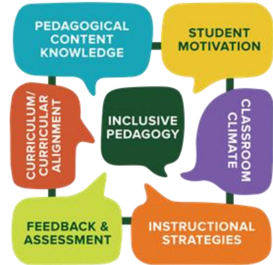
Teaching Effectiveness Framework